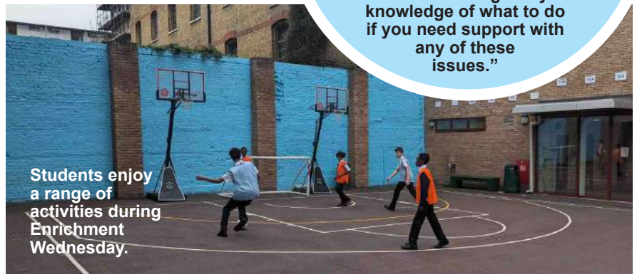
Students enjoy a range of activities during Enrichment Wednesday.

“Varied interests are also really important when it comes to social, emotional and employment skills.”