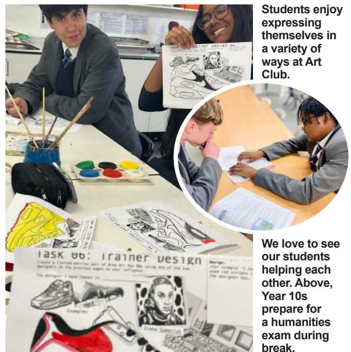
Students enjoy expressing themselves in a variety of ways at Art Club.