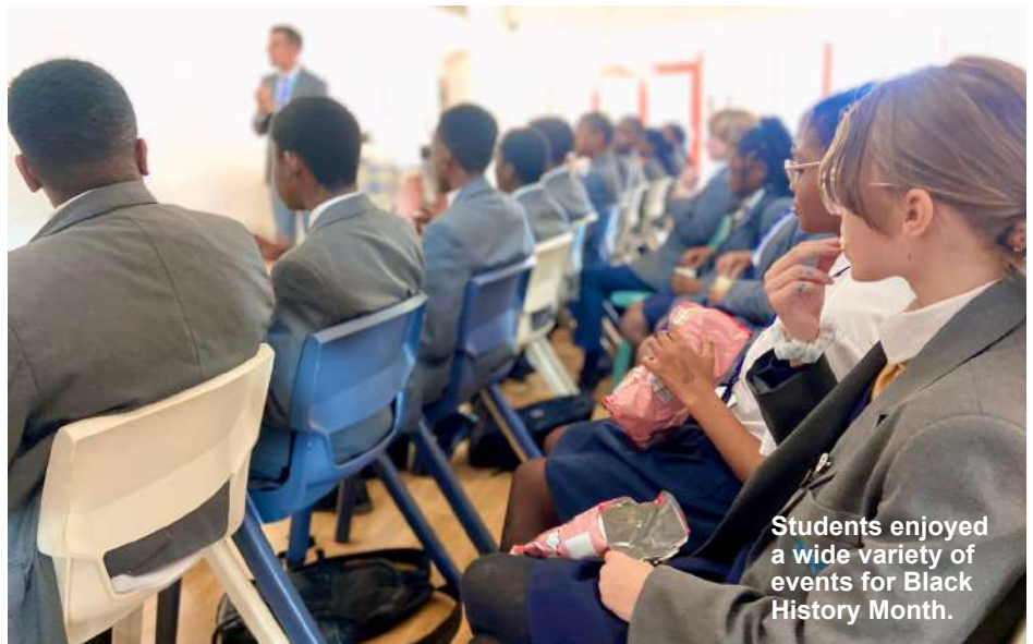
Students enjoyed a wide variety of events for Black History Month.