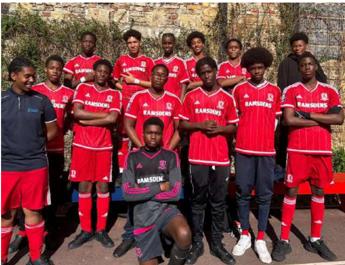
Our boy's Year 11 football team ahead of a match.