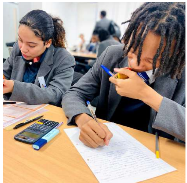
STARTING early to prepare for geography mock exam.