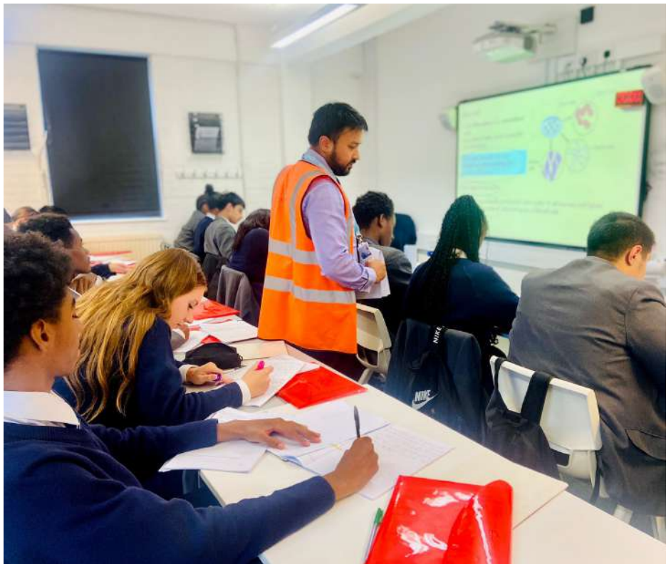
Hardwork revising before and after school has paid off.