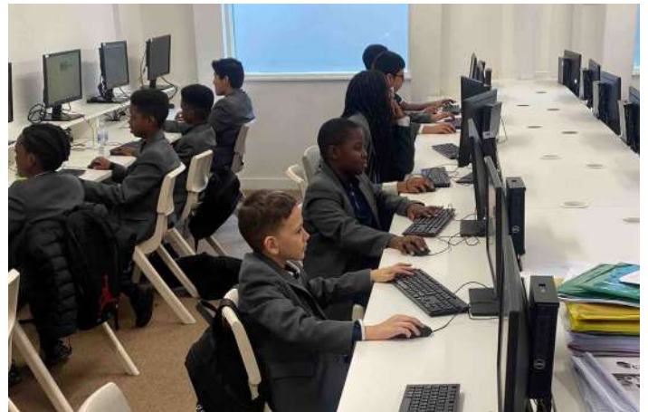
Students working hard at our lunchtime Computer Club.