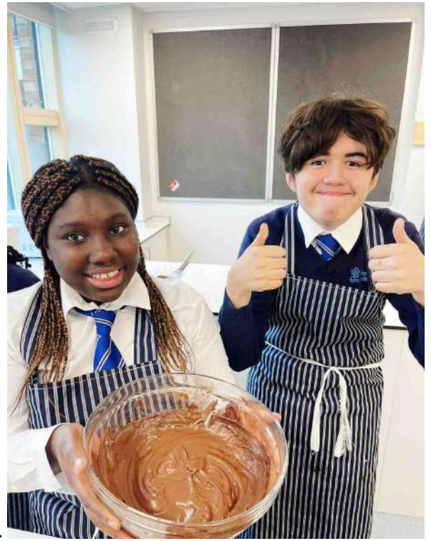
Year 7 Food Tech class enjoy making brownies.