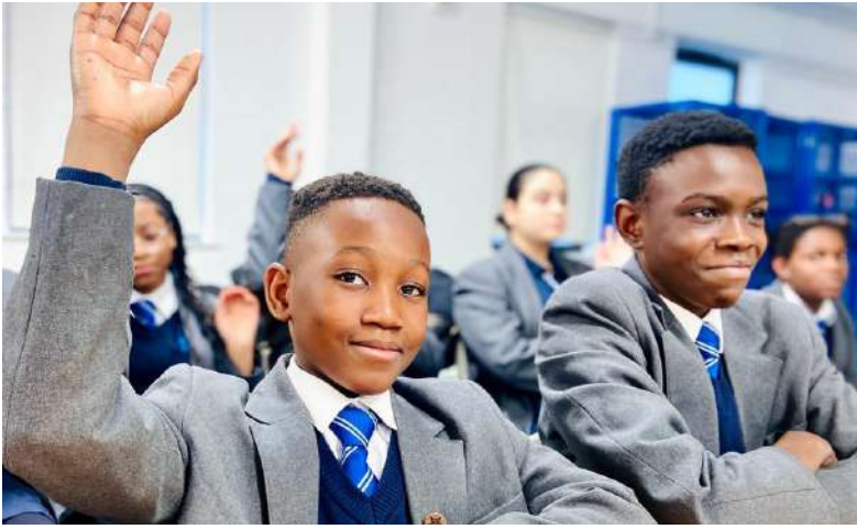
YEAR 7 and 8 students heard from a professional from MACE Construction as part of our Careers Day.