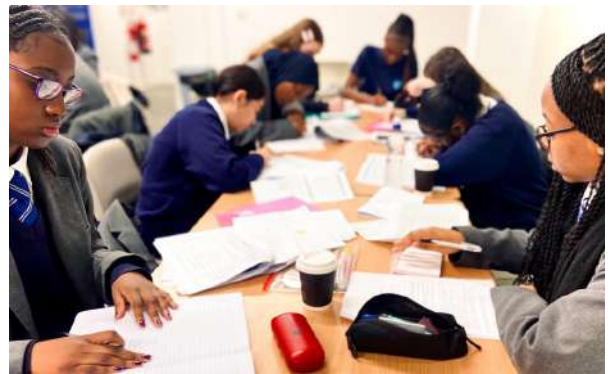
STUDENTS attend an early morning religious studies intervention in a bid to boost their exam prospects.