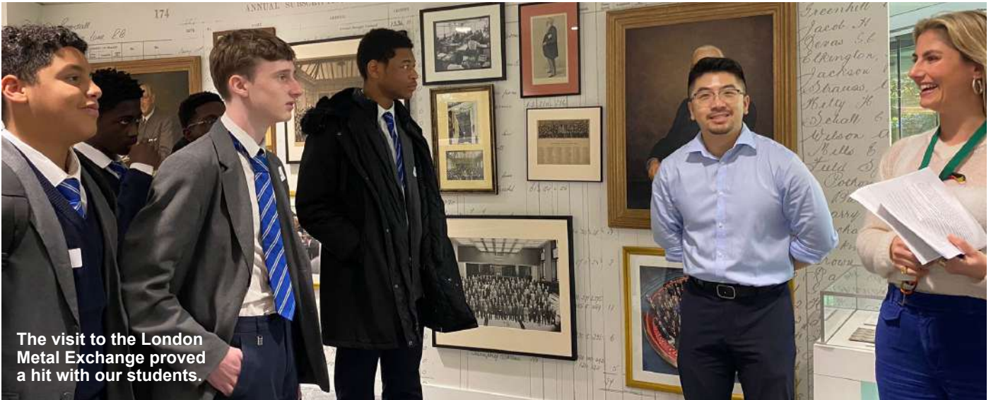
The visit to the London Metal Exchange proved a hit with our students.