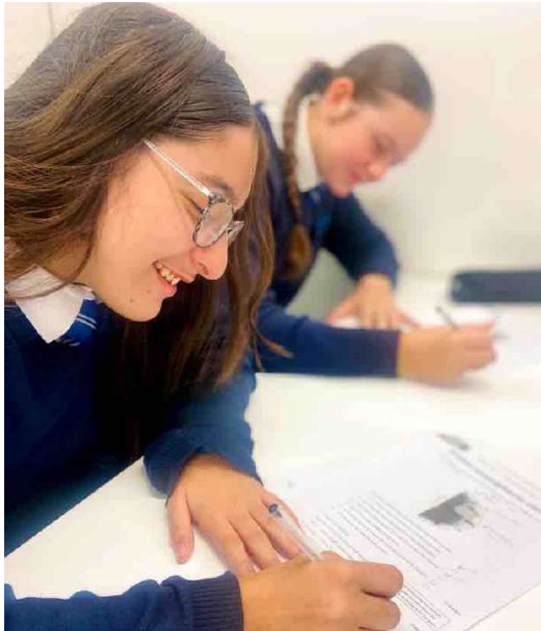
At school at 7.30am for history revision despite Storm Ciarán.