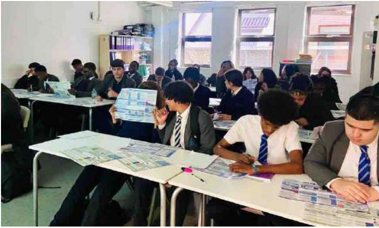
OUR Year 11 students have been getting in to school early for revision and intervention sessions ahead of their mock GCSE exams.